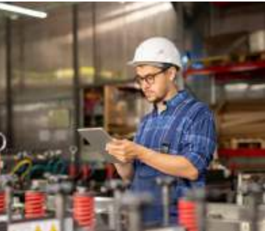
Field Technician Connect with a remote subject matter expert whenever support is needed

Vuforia Chalk enables the industrial enterprise to rapidly and cost-effectively get augmented reality (AR) in the hands of service and operations technicians with the mobile devices they have today.