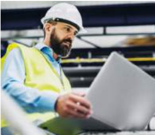
Remote Expert Connect with your workforce to provide live guidance from desktop or mobile