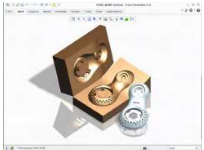
A PTC Creo rendering of core mold and plastic parts.