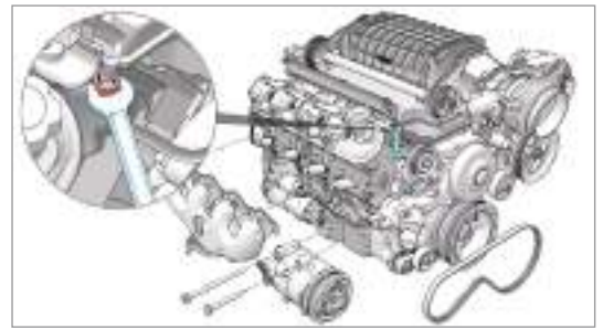
Engine illustration with inset view for clarity