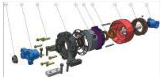
Exploded illustration with callouts