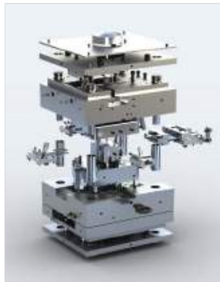
This moldbase was developed with PTC Creo Expert Moldbase Extension and rendered in PTC Creo Parametric™.